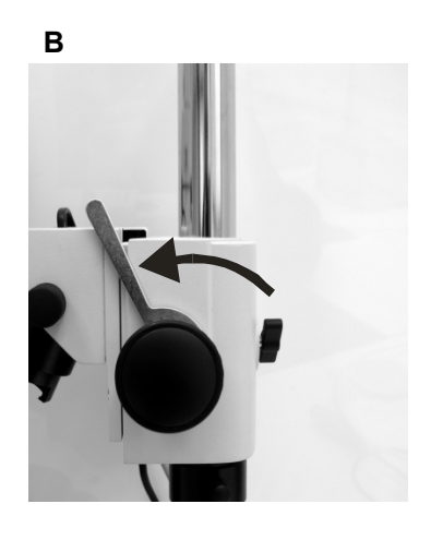
15. Focus head